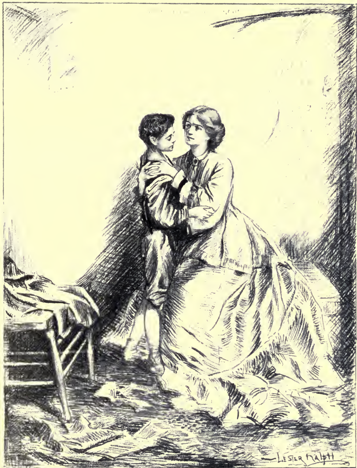
With a quick impulse she clasped him to her Page 15